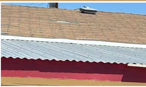
Holbrook, AZ Navajo, Parsonage re-roof project