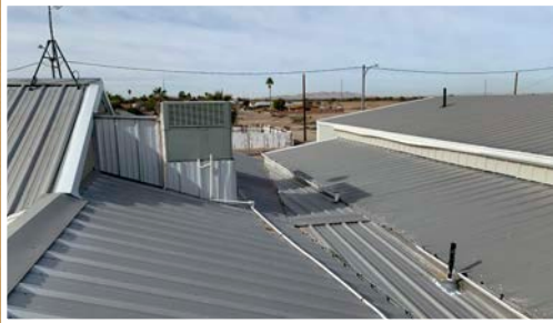
Eloy, AZ Roof re-build project