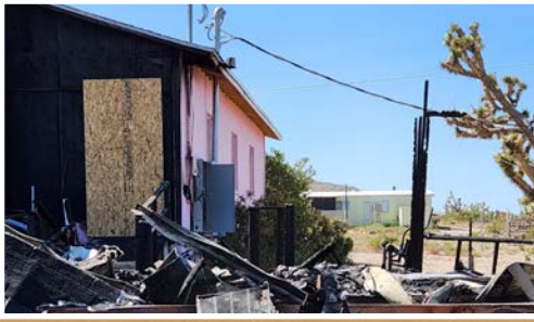
Dolan Springs, AZ Church fire. Renovation Project Fall 2023