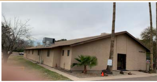
Glendale, AZ Church Fellowship Hall re-roof Project